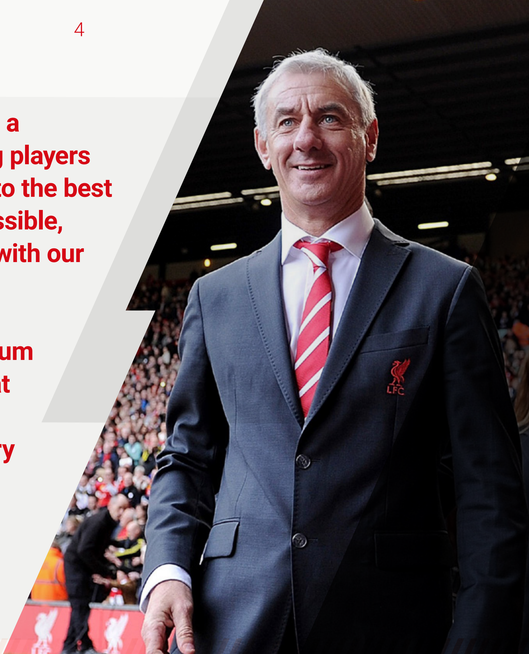
IAN RUSH, LFC LEGEND & AMBASSADOR